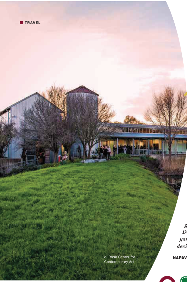
di Rosa Center for Contemporary Art