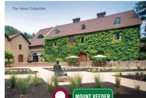
The Hess Collection