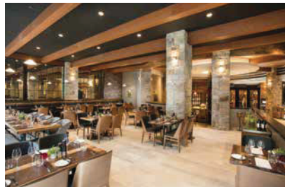
Charlie Palmer Steak Napa