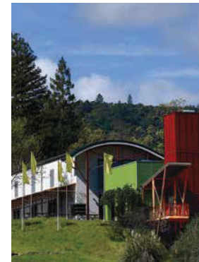
Napa Valley Museum

From July 7 to August 19, the NAPA VALLEY MUSEUM will present the exhibit "50 Years of the Napa Valley Agricultural Preserve" in its Spotlight Gallery, showcasing the history of Napa Valley's Agricultural Preserve and its role in protecting Napa Valley as a national treasure. napavalleymuseum.org