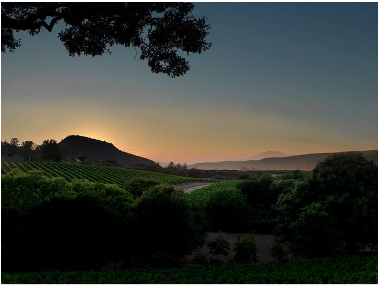
Acumen's estate vineyards on Atlas Peak make for stellar cabernet sauvignon wines.

The tasting room includes seated areas and a small bar. Guests can experience two offerings: the Estate Tasting ($40), a more casual tasting of estate wines, and the seated Summit Experience ($55), which guides guests on a tasting paired with local cheese and charcuterie.